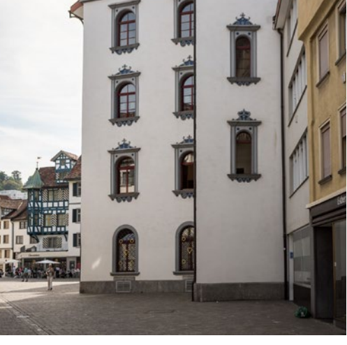
THE TOWN HOUSE OF THE CITIZENS' MUNICIPALITY OF ST.GALLEN WAS ALSO CALLED "THE HALF HOUSE" BECAUSE OF ITS UNUSUAL GROUND PLAN; PERHAPS THERE WAS A PLAN TO EXTEND IT.